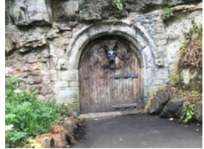
Medieval Studded Door