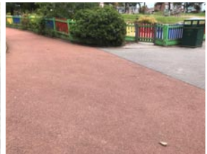
Activity Play Area