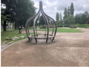
Wooden Sculpture 1