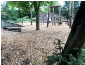
Activity Play Area