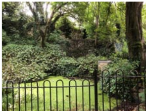
Park Pond and Waterfall