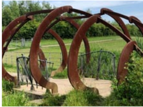
Green Heart Bridge