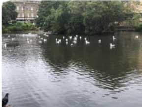
Mowbray Park Pond