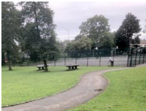
Park Tennis Courts