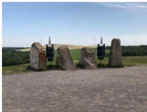
Sight Lines Sculpture