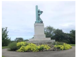
Jack Crawford Statue