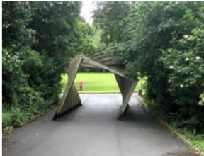
Wooden Sculpture 2