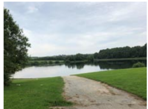
Hetton Park Lake