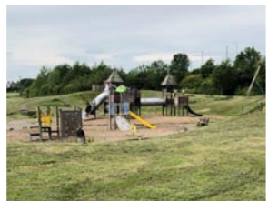
Activity Play Area