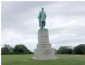
Henry Havelock Statue