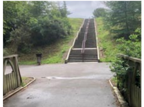
The Grand Staircase and bridge