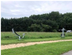
Outdoor Activity Area

We have listed 5 landmarks below. Each landmark has a photo so you can travel around the park to find these points of interest, you could even take a selfie!