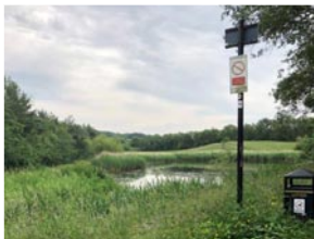
Conservation and Swamp Area