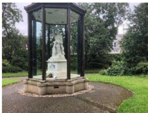
Victoria Hall Disaster Memorial