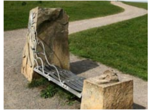
The Lions Seat