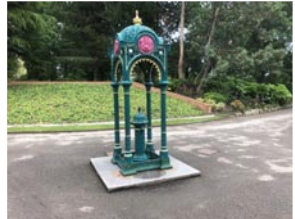
William Hall Water Fountain