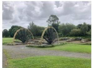
Miners Memorial Garden