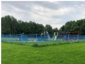
Activity Play Park