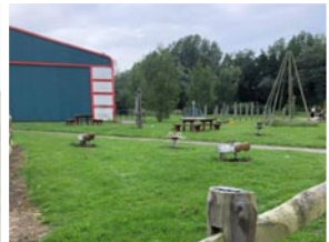
Activity Play Park