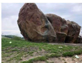
The Pit Track