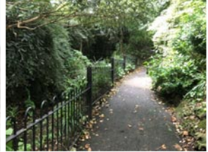
The Fairy Grotto