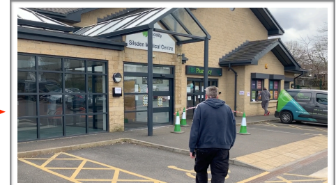
Patient is asked to come to the door