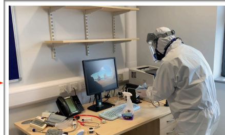
The room is cleaned after every patient