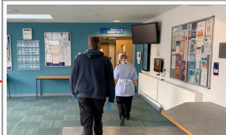
The patient is led to the GP