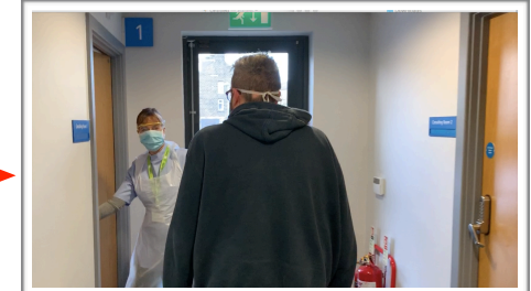
The patient is shown into room by GP