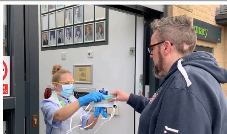
The patient puts on a mask & gloves