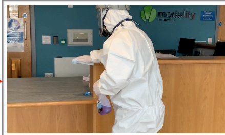
The area is cleaned after every patient