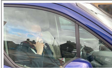
Patient speaks to Red Hub GP