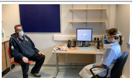
The patient has consultation