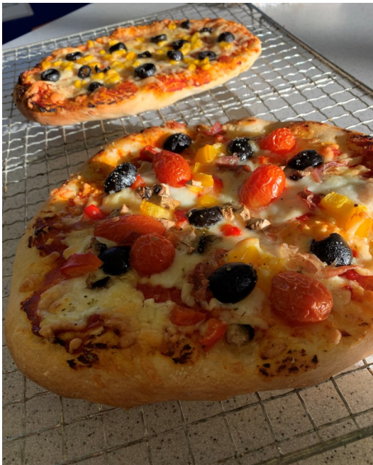
Delicious pizzas made by the children