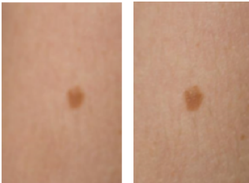
OUT OF FOCUS