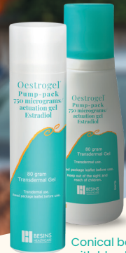
Cylindrical bottle with white lid