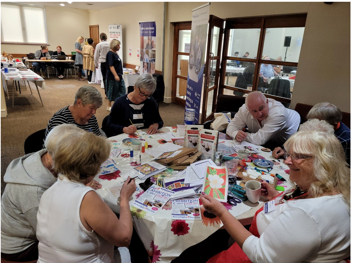
Figure 3 Memory Cafes and groups provide stimulation and support for everyone affected by dementia

Lastly, don't overlook the option of respite care . This provides a short break for the person with dementia, either at home or in a care setting, while you take some time for yourself. Respite care can be invaluable in allowing caregivers to recharge and focus on their own wellbeing.