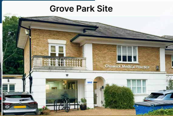
Grove Park Site