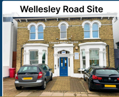
Wellesley Road Site