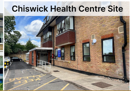
Chiswick Health Centre Site

Welcome to the latest edition of our Newsletter! This newsletter is for patients of Chiswick medical Practice and aims to keep you updated with our newest developments. Thank you for being part of our community—we hope you find this newsletter both informative and inspiring.