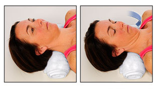
C Healthwise, Incorporated