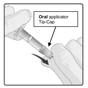
1. Remove the protective tip cap from the oral applicator.

Instructions for administration of the vaccine: