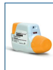
Duaklir® Genuair formoterol & aclidinium (dry powder)