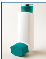
Atimos® Modulite formoterol (aerosol)