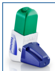
Easyhaler® formoterol (dry powder)