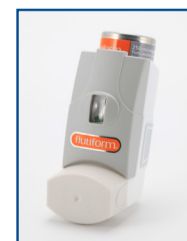
Flutiform® MDI* fluticasone propionate & formoterol (aerosol)