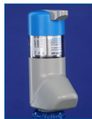
Airomir® Autohaler salbutamol (aerosol)