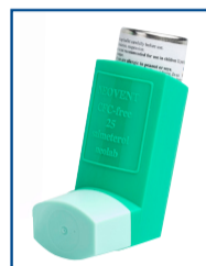
Neovent® MDI* salmeterol (aerosol)