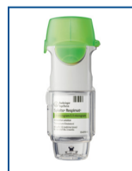
Spiolto® Respimat tiotropium & olodaterol (solution for inhalation)