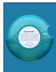
Serevent® Accuhaler salmeterol (dry powder)