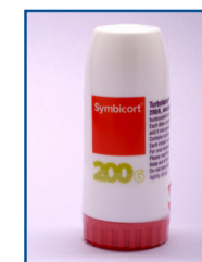
Symbicort® Turbohaler budesonide & formoterol (dry powder)