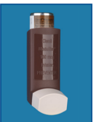
Clenil® Modulite MDI* beclometasone (aerosol)