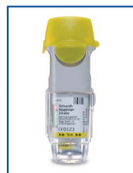
Striverdi® Respimat olodaterol (solution for inhalation)