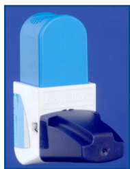
Easyhaler® salbutamol (dry powder)