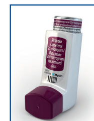
Sirdupla® MDI* fluticasone propionate & salmeterol (aerosol)