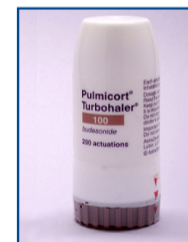
Pulmicort® Turbohaler budesonide (dry powder)