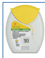
Relvar® Ellipta fluticasone furoate & vilanterol (dry powder)