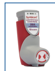
Symbicort MDI* budesonide & formoterol (aerosol)