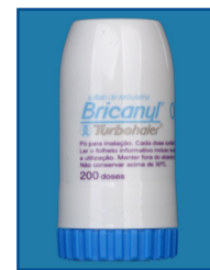
Bricanyl® Turbohaler terbutaline (dry powder)