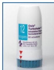
Oxis® Turbohaler formoterol (dry powder)