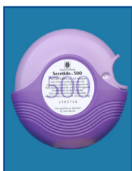
Seretide® Accuhaler fluticasone propionate & salmeterol (dry powder)