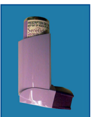
Seretide® Evohaler fluticasone propionate & salmeterol (aerosol)