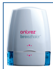
Onbrez® Breezhaler indacaterol (inhalation powder, hard capsule)