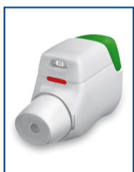
Eklira® Genuair aclidinium (dry powder)