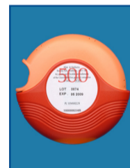
Flixotide® Accuhaler fluticasone propionate (dry powder)