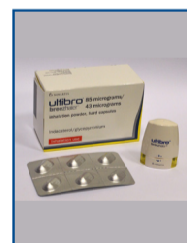
Ultibro® Breezhaler glycopyrronium & indacaterol (inhalation powder, hard capsule)