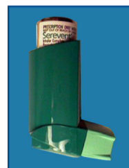
Serevent® salmeterol (aerosol)