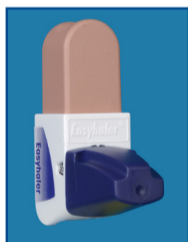
Easyhaler® beclometasone (dry powder)