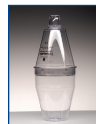
Volumatic® large volume spacer also available with paediatric mask