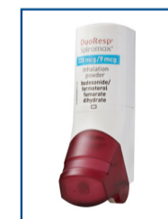
Duoresp® Spiromax budesonide & formoterol (dry powder)