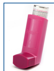
Fostair® MDI* beclometasone & formoterol (aerosol)