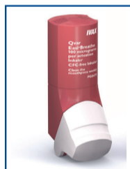
Qvar® Easi-Breathe beclometasone (aerosol)