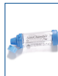
Aerochamber Plus® medium volume spacer also available as child (yellow) and infant (orange) spacers