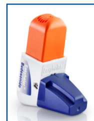
Easyhaler® budesonide (dry powder)