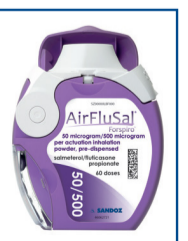
AirFluSal® Forspiro fluticasone propionate & salmeterol (dry powder)