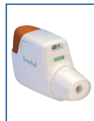
Budelin® Novolizer budesonide (dry powder)