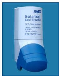
Salamol® Easi-Breathe salbutamol (aerosol)