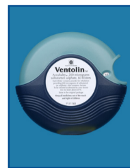
Ventolin® Accuhaler salbutamol (dry powder)