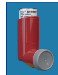
Qvar® MDI* beclometasone (aerosol)