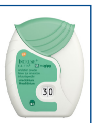
Incruse® Ellipta umeclidinium (dry powder)