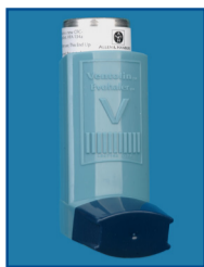
Salbutamol MDI* (aerosol) Brands include: Airomir®, AirSalb®, Salamol®, Ventolin®