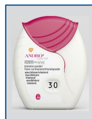
Anoro® Ellipta vilanterol & umeclidinium (dry powder)