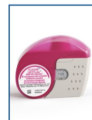
Fostair® NEXThaler beclometasone & formoterol (dry powder)