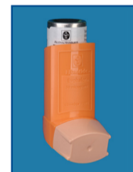
Flixotide® Evohaler fluticasone propionate (aerosol)