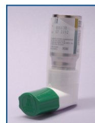
Atrovent® MDI* ipratropium (aerosol)