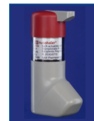
Qvar® Autohaler beclometasone (aerosol)