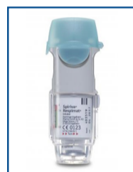
Spiriva® Respimat tiotropium (solution for inhalation)