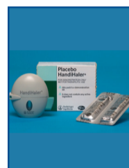
Spiriva® HandiHaler & capsules, tiotropium (inhalation powder, hard capsule)