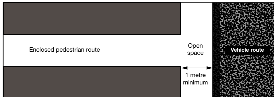
Figure 2 An enclosed pedestrian route

in both directions. In the case of a one-way route, the pedestrian should be able to see in the direction of oncoming traffic. Where such a space cannot be achieved, barriers or rails should be provided to prevent pedestrians walking directly onto the vehicle route.