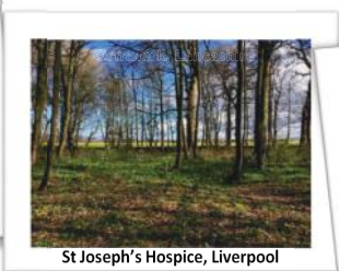
St Joseph's Hospice, Liverpool