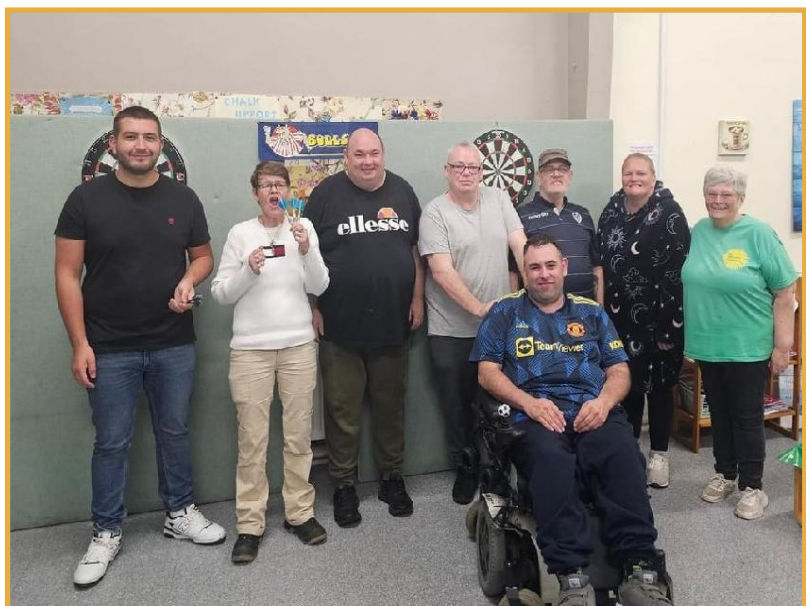
Participants in the darts marathon

It will be located outside and accessible for anyone who needs to use a defibrillator.