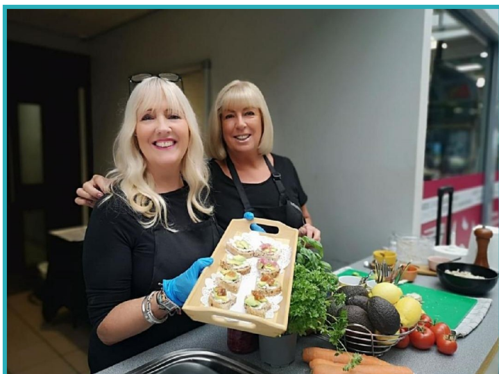
The Saving the Sandwich demonstration gave visitors lots of ideas for low cost, nutritious alternative sandwiches and wraps.