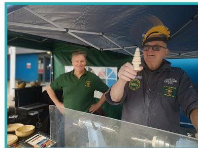
Trafford Woodcraft Club