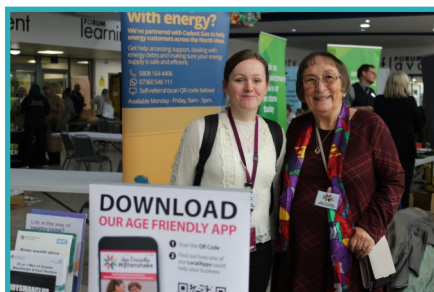
The Age Friendly Wythenshawe stall was busy with enquiries for its free mobile app