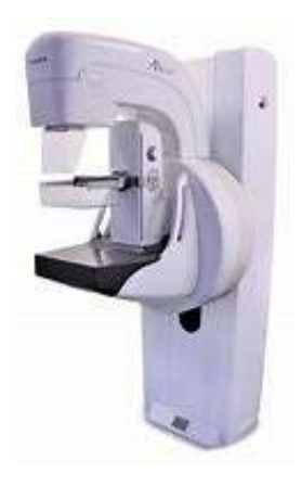
Explore the mammogram machines! Learn how to check your boobs and stay healthy!