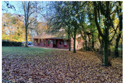
Oakenshaw Community Centre

One part of the county where we have very few members is Redditch . We are keen for this to change in 2025 and want to increase awareness of prostate cancer in the town. With a population of over 82,000 Redditch is easily the county's second largest town after Worcester (101,000) and much larger than Kidderminster (57,000). We begin the process by attending their ' Tackling Mental Health Together ' day at Redditch FC on Monday, January 20th. (10.00-16.00) . If you are a member in the Redditch area, please drop by and have a chat with us on the KWPCSG stand. Our next commitment to the town is to run our first PSA testing event of 2025 there. The venue is Oakenshaw Community Centre (see Calendar on back cover for more details). It will be another first for the group in trialling a PSA event on a Saturday (March 8th., 09.30-12.30) .