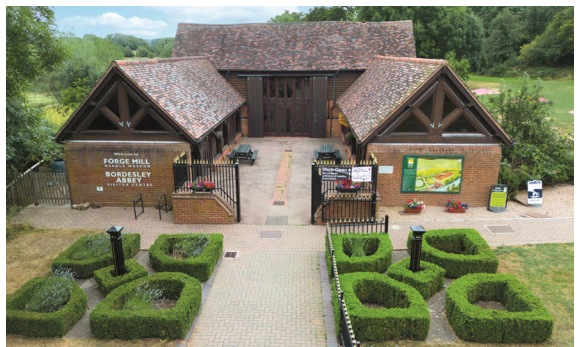
Bordesley Abbey Visitor Centre, café and the Woodward Room (left) on the Forge Mill Needle Museum site

We are delighted to announce that our first Coffee & Chat of 2025 will be held for the first time in Redditch . Not only that, but we have booked for it to take place at the beautiful site where both the Forge Mill Needle Museum and the ruins of Bordesley Abbey are situated. We hope our relatively few members in the Redditch area will turn out in force and bring a few non-members with them, but we hope also that some of you will take the opportunity to stay on after the C&C to have a tour of the Needle Mill and Visitors' Centre (cost at time of writing: £ 6.80 per adult).