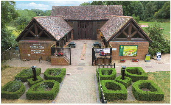
Bordesley Abbey Visitor Centre, café and the Woodward Room (left) on the Force Mill Needle Museum site

We are delighted to announce that our first Coffee & Chat of 2025 will be held for the first time in Redditch . Not only that, but we have booked for it to take place at the beautiful site where both the Forge Mill Needle Museum and the ruins of Bordesley Abbey are situated. We hope our relatively few members in the Redditch area will turn out in force and bring a few non-members with them, but we hope also that some of you will take the opportunity to stay on after the C&C to have a tour of the Needle Mill and Visitors' Centre (cost at time of writing: £ 6.80 per adult).