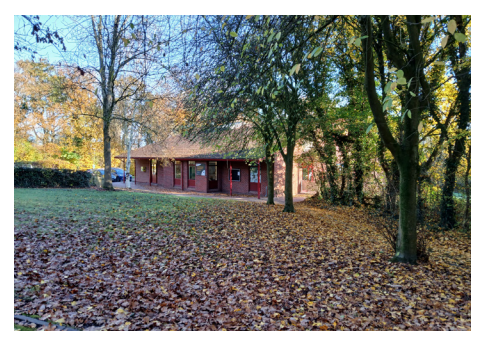
Oakenshaw Community Centre

of over 82,000 Redditch is easily the county's second largest town after Worcester (101,000) and much larger than Kidderminster (57,000). We begin the process by attending their 'Tackling Mental Health Together' day at Redditch FC on Monday, January 20th. (10.00-16.00). If you are a member in the Redditch area, please drop by and have a chat with us on the KWPCSG stand. Our next commitment to the town is to run our first PSA testing event of 2025 there. The venue is Oakenshaw Community Centre (see Calendar on back cover for more details). It will be another first for the group in trialling a PSA event on a Saturday (March 8th., 09.30-12.30).