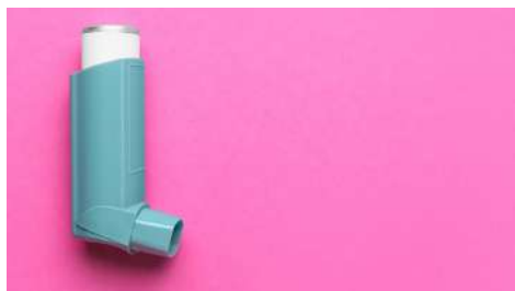
How to use my inhaler (Link to Video)