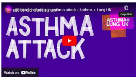
How to manage an asthma attack (Video)