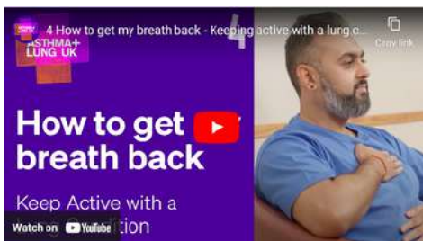
How to get your breath back! (Video)