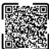
Start for Life Offer 0 – 5 years and families