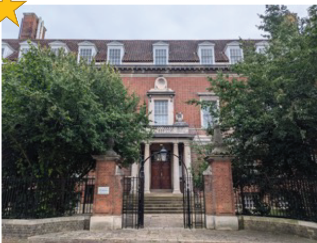
Front entrance from Tennis Court Road