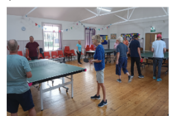
Table tennis 1-3pm (£3) Come along and meet others, enjoy an afternoon of exercise and fun. Adults only. Refreshments provided.